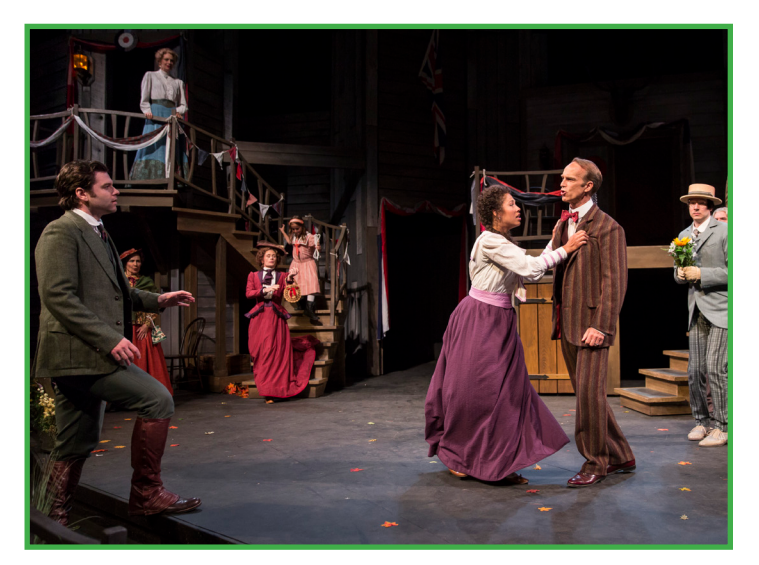
Things get a little tense when no one in the Page family agrees on who Anne should marry.