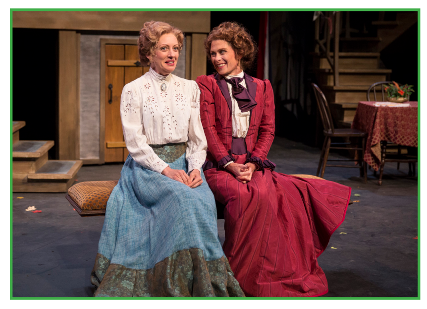
It's helpful to have friends playing friends on stage.

the ones generally thinking, plotting and outsmarting the Windsor men.